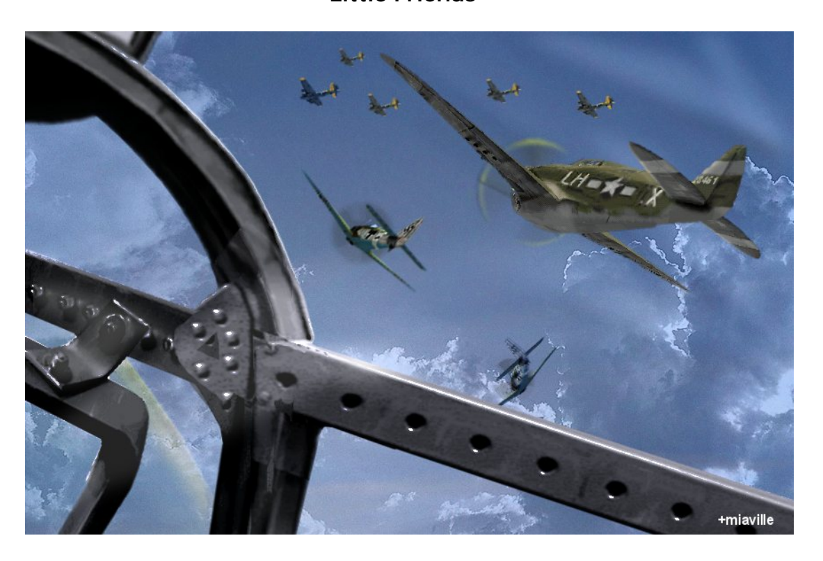
By Jcritter 17<sup>th</sup> AAC CO and Trukk 78<sup>th</sup> FG CO